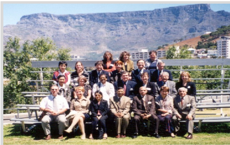
Group shot from the IRLI workshop in Cape Town, South Africa, Nov 2003.