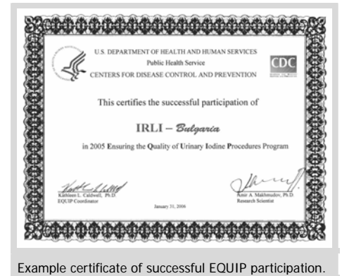
Example certificate of successful EQUIP participation.

IRLI labs are required to participate in the EQUIP program. The labs are expected to meet the 80% proficiency score in the most recent three consecutive rounds of quality assurance testing. Labs that do not submit EQUIP results, must communicate the reasons to CDC EQUIP program as soon as possible and before the results submission deadline. For the year 2005, 58% of participating IRLI labs were granted a 'successful participation certificate' (scored 80% or higher) and 42% were granted a 'participation certificate' (scored less than 80%). IRLI labs that did not perform well, received additional technical assistance from CDC. Four IRLI labs did exceptionally well with a score of 100%. To improve efficiency of EQUIP, CDC has developed a Web-based data reporting system, now available at https://www2a.cdc.gov/nceh/dls/itndatasubmission/login.asp . The Web site has data submission forms, reports from previous EQUIP rounds, and a discussion board. Each EQUIP lab has received a login ID and a password, and all EQUIP labs are encouraged to use the Web site as a tool to communicate with staff members in other labs that conduct iodine analysis. Almost 60% of the participating EQUIP labs use the Web-based reporting system.