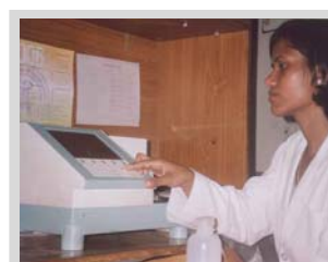
IRLI-India Lab Staff at work in the urinary iodine lab, 2006.