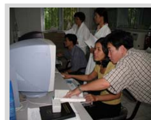
IRLI-China holds a training session on data analysis.

IRLI-Russia representatives Alexander Ilyin and Ekaterina Troshina have identified five labs in Russia that are equipped for UI analysis. IRLI-Russia lab staff plans to establish a regional external quality assurance program for these labs. In 2005, IRLI Russia lab analyzed 30 urine iodine samples for Armenia and 5200